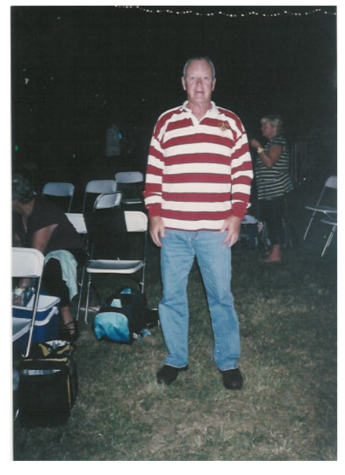
It's Not Unusual!! Spotted at a Tom Jones concert in New Zealand